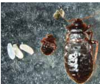
Figure 2. Eggs, nymph, and mature bed bug