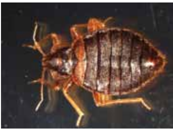
Figure 1. Bed bug

In recent years, reports of infestations are becoming more frequent in homes, hotels, dormitories, and other locations. Bed bugs are most often associated with clutter and filth, but infestations have also been reported in the finest hotels and living accommodations. Although there is no specific explanation for the resurgence of this pest, increased international travel and pesticides with reduced residual activity have probably contributed.