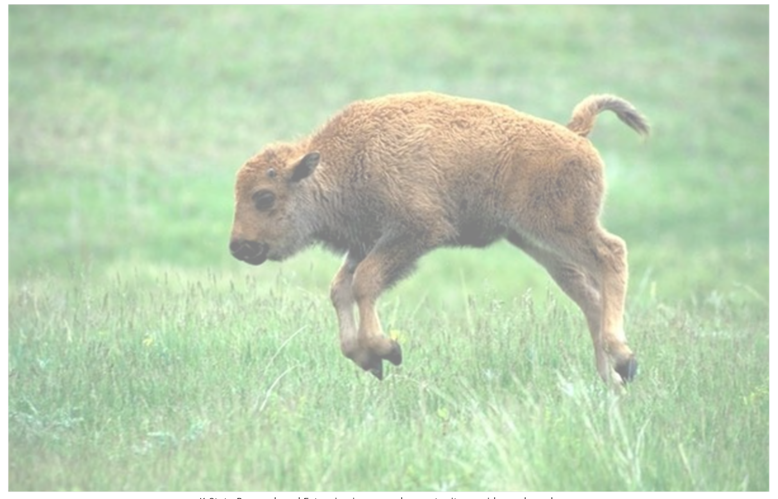
K-State Research and Extension is an equal opportunity provider and employer.

September 30- October 2 - Kansas Junior Livestock Show