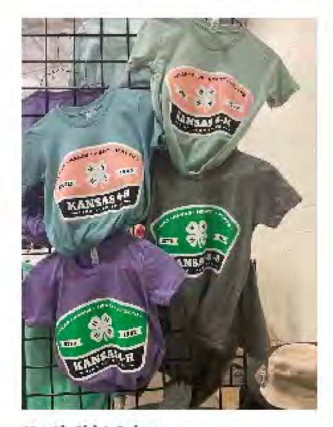
Youth Shirt Colors