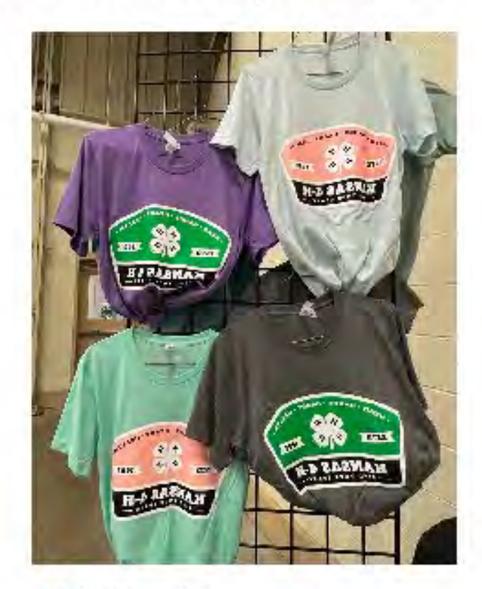
Adult Shirt Colors