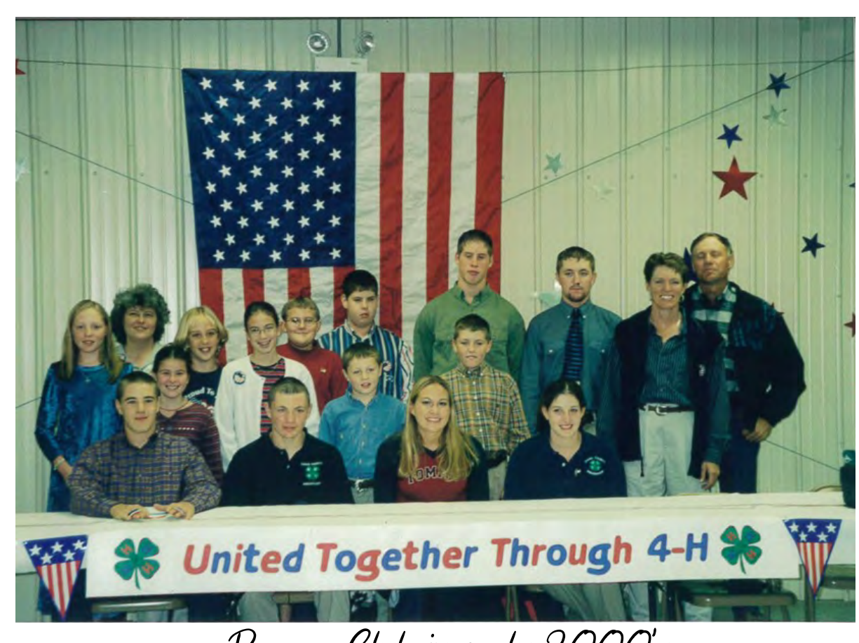
Bazaar Club in early 2000's