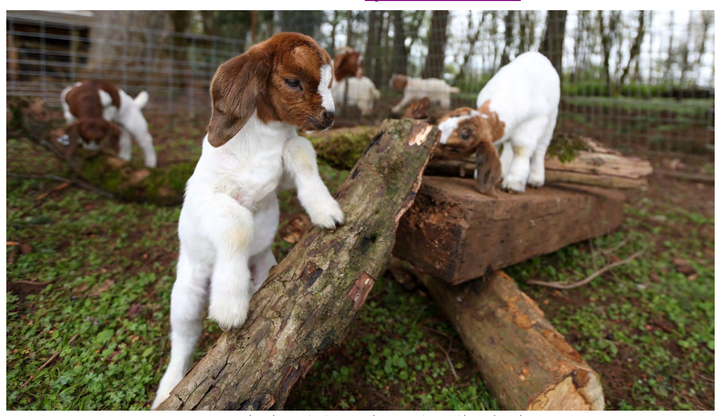
K-State Research and Extension is an equal opportunity provider and employer.

https://www.kansas4-h.org/projects/animal-science/horse/equine-webinar-series.html