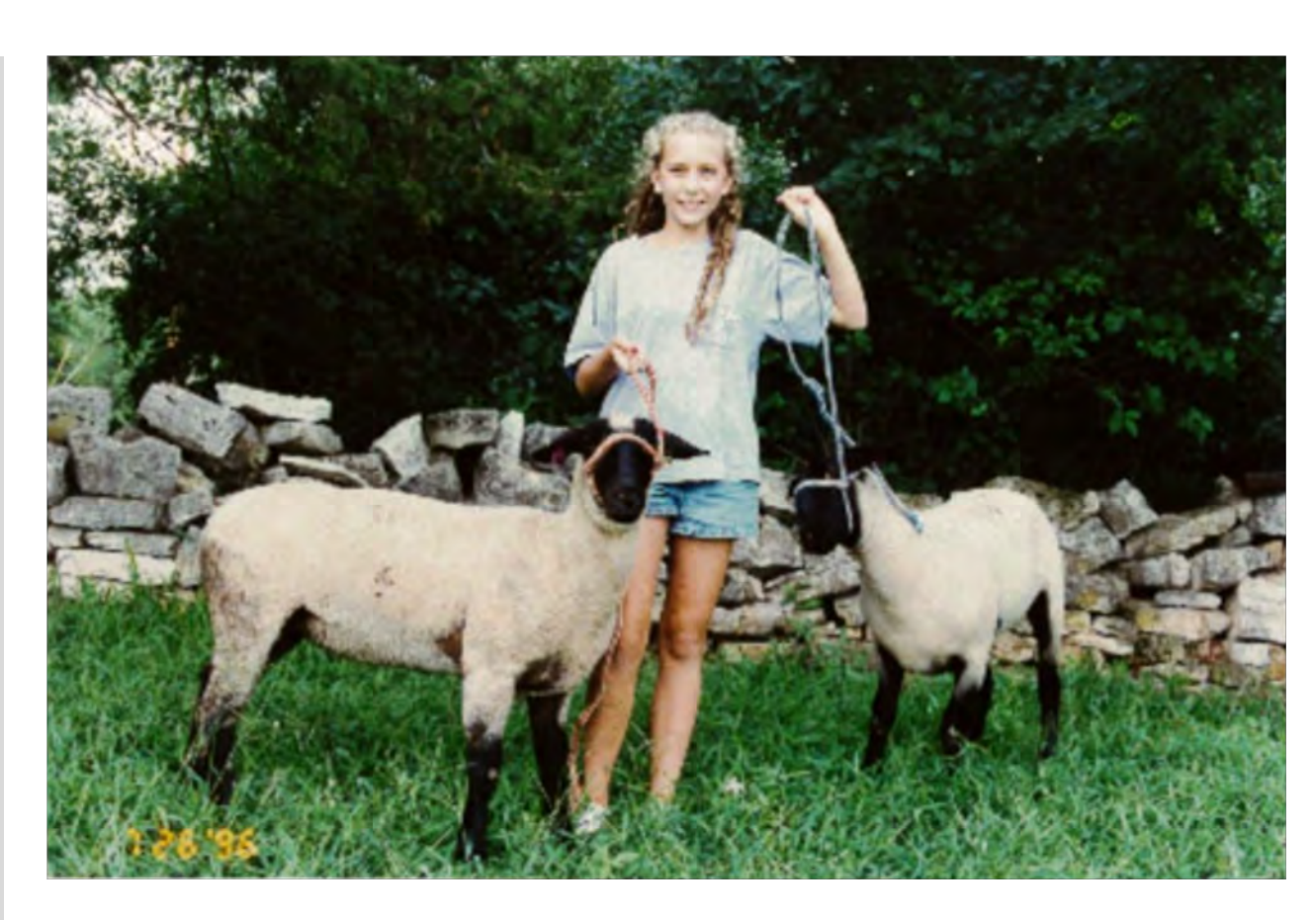
90's McDiffett lambs